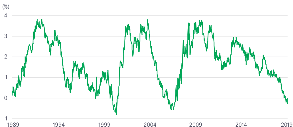
Chart 3: The US 3-month-10-year yield curve

Source: Refinitiv, Manulife Investment Management, as of 12 August, 2019.